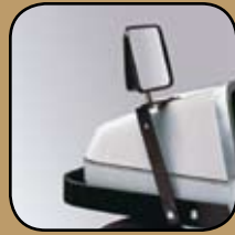
West Coast Mirror/ Heavy-Duty Bumper