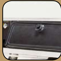
Glove Box With Lock