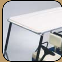
Canopy Top White and Beige