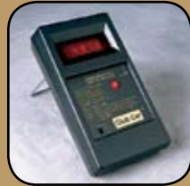
Communication Display Module