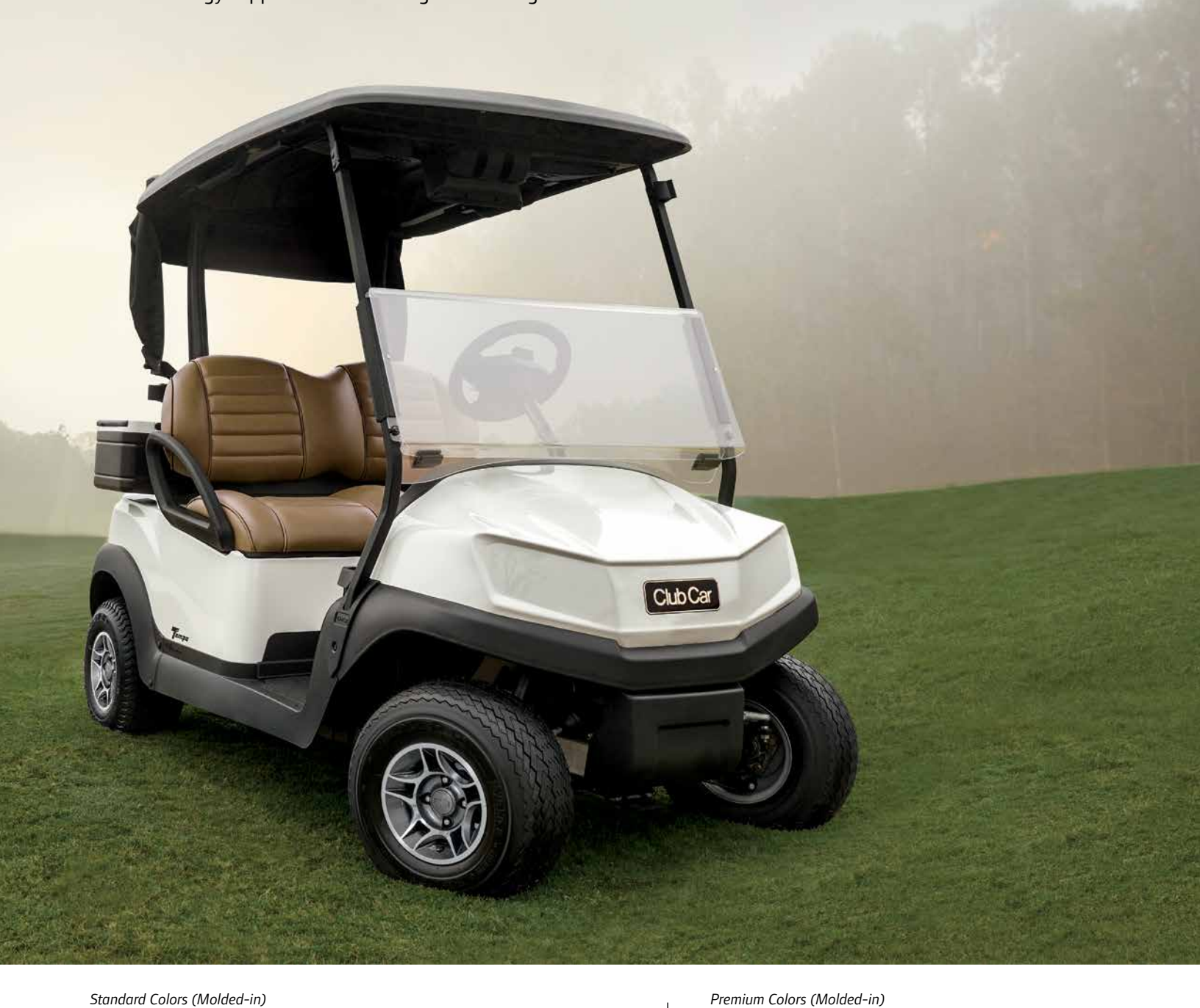
Standard Colors (Molded-in)

Designed with automotive styling, the Tempo is backed by proven engineering and a reputation for reliability. Plus, available connected technology supports course management and golfer entertainment.