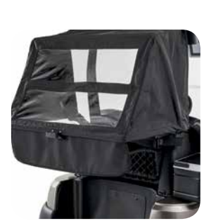
Bag Cover with Magnetic Latch