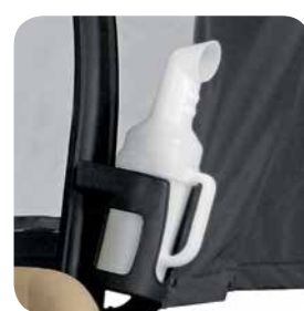
Divot Repair Sand Bottle