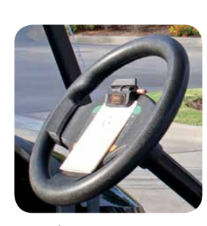
Comfort Grip Steering Wheel