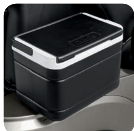
Caddy Master Cooler

Two-Tone Black and Gray Black also available